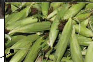
Premium product quality: Harvest fresh market sweet corn with the efficient CP100