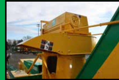
Loading versatility: Load to the left, right, or rear, the choice is yours! A full 180 degrees of rotation on the conveyor makes harvest quick and easy.