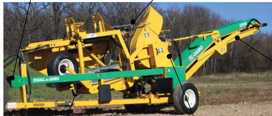
Gentle handling: No aggressive stalk rolls. Just gentle rubber belts to grip the stalks, and two hydraulically driven rollers to gently pull the ears off the stalks.