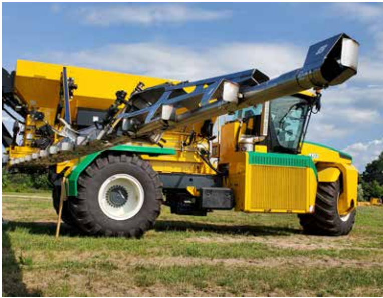
4103 AccuAir air system