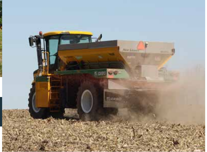
4103 New Leader

The right spreader for any size application