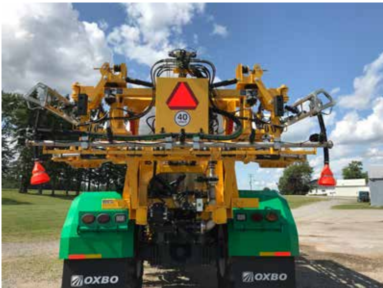
4103 AccuSpray liquid system

The right spreader for any size application