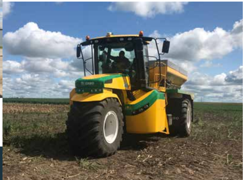
4103 AccuApply combination unit