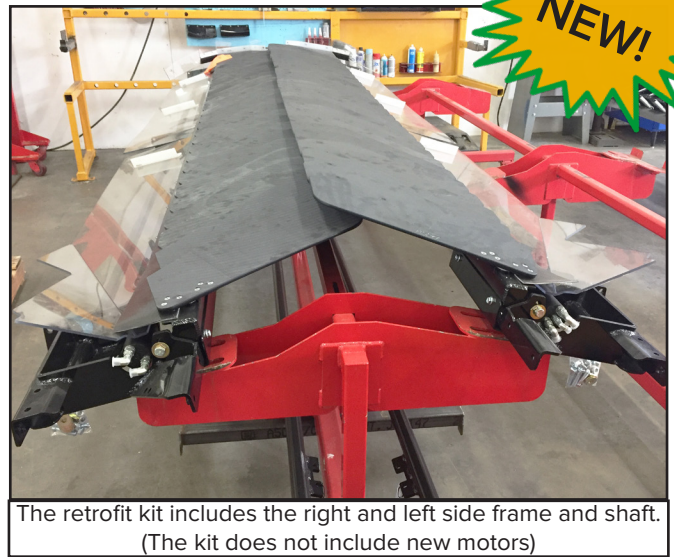
The retrofit kit includes the right and left side frame and shaft. (The kit does not include new motors)

In the current design the shaker pan motors extend out the front of the frame weldment with no additional protection.