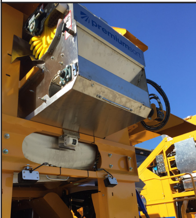
Destemmer Pan (2016 and newer) with convenient latch design