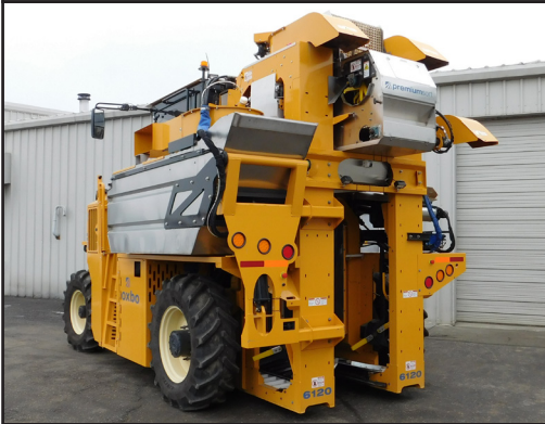
Previous Pan Design (2015) (Bolts Are For Truck-Transport Only)